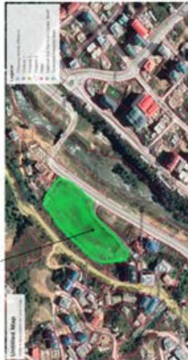
Urban Hub Precinct in Jungahna LAP