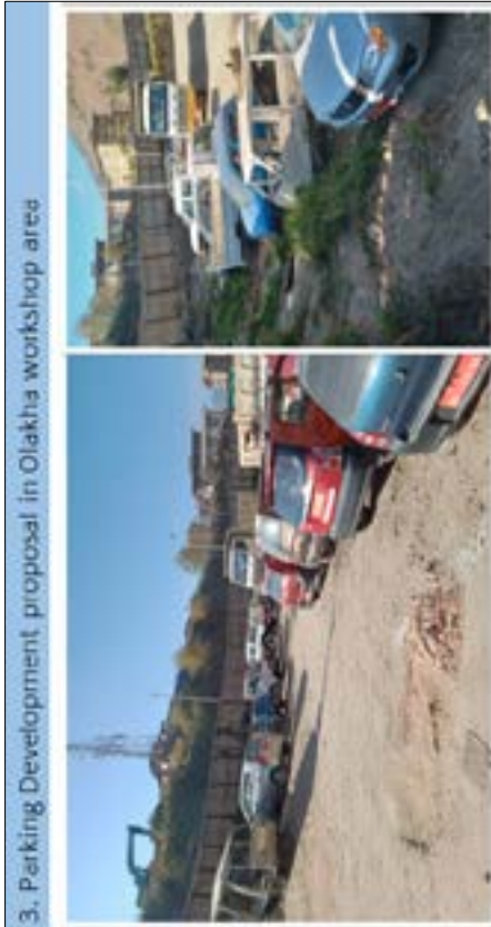
3. Parking Development proposal in Olakha workshop area