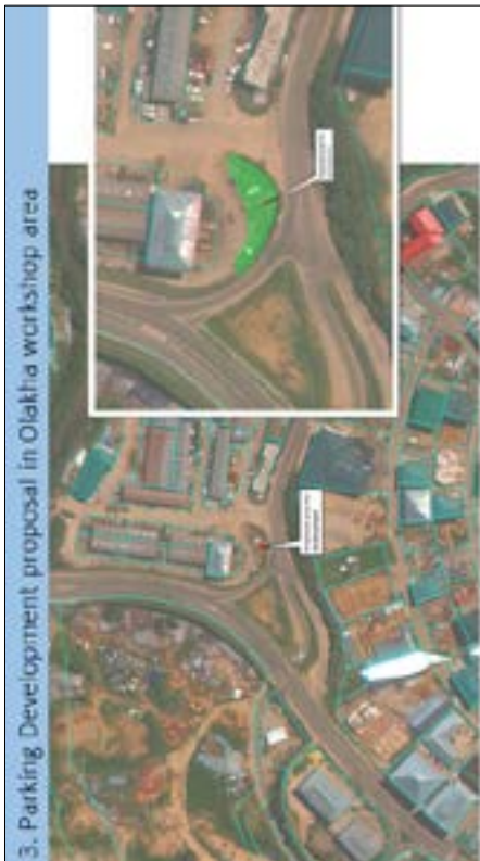
3. Parking Development proposal in Olakha workshop area