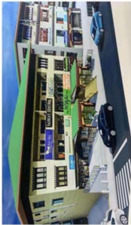
Owner's proposal for rectification