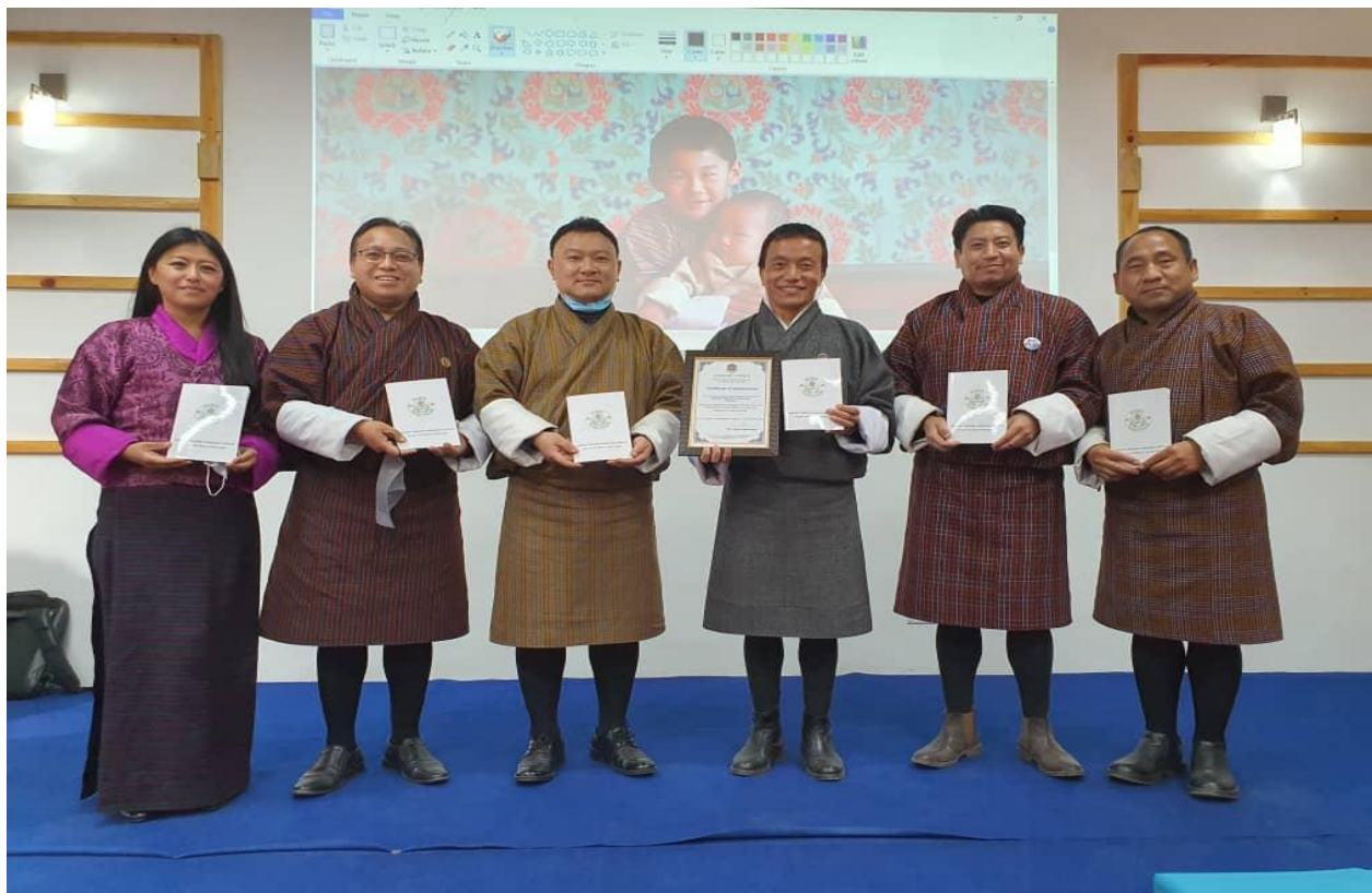
Figure 1- Launching of Thromde Workforce Service Rule

The Management has formed a task force to work on it and the taskforce later presented to the Management and then to Tshogde for endorsement. After the endorsement by the Tshogde , it was presented to the Ministry of Labour of Human Resource (MoLHR). The same was then endorsed by the MoLHR.