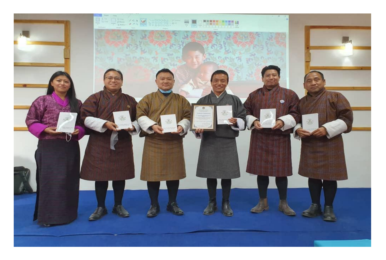
Figure 1- Launching of Thromde Workforce Service Rule

The Management has formed a task force to work on it and the taskforce later presented to the Management and then to Tshogde for endorsement. After the endorsement by the Tshogde , it was presented to the Ministry of Labour of Human Resource (MoLHR). The same was then endorsed by the MoLHR.