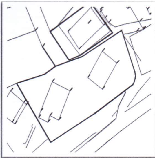
Demarcated plot during NCRP

The Chairman said that if there is no other implication to our plot owners then we can go ahead with the proposed changes.